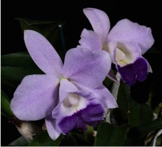
Cattleya Mini Purple - Blue Chateau

There were 15 orchids presented for judging. Five (5) were awarded.