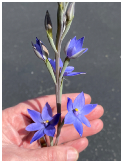
Thelymitra crinita x nuda