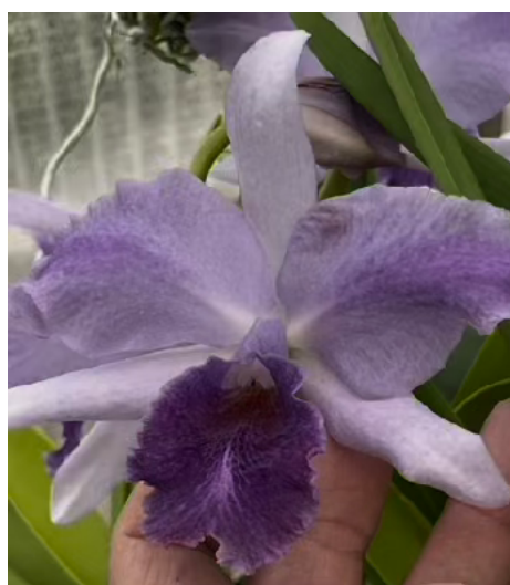
Catt. Mary Elizabeth Bohn 'Royal Flare'