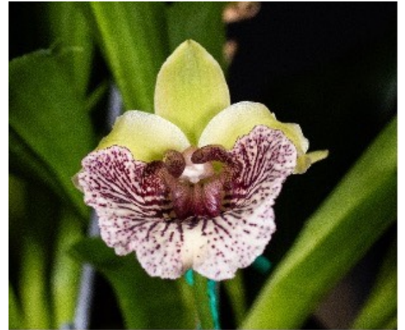
Warczewiczella timbiensis - O'side's Marble

Awarded Highly Commendable Certificate, 79 points