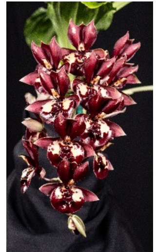
Ctsm. Extravaganza - Sunset Valley Orchid's

Awarded Highly Commendable Certificate, 78 points