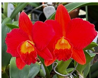
Slc. Stella Kacev

The Dove library will be on your left and there is a large, well-lit parking lot. The Gowland Meeting Room is located on the right hand side of the main entrance.