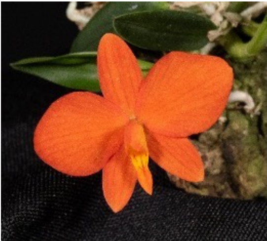
Cattleya pygmaea - B.R.O.